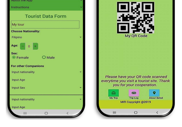
Figure 1. Screenshot of Mobile Registration and Tourist Information Capture