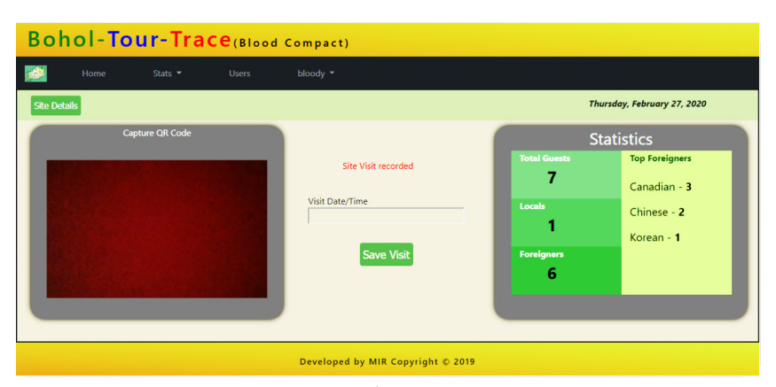
Figure 2. Screenshot of Tour Provider QR Scanner