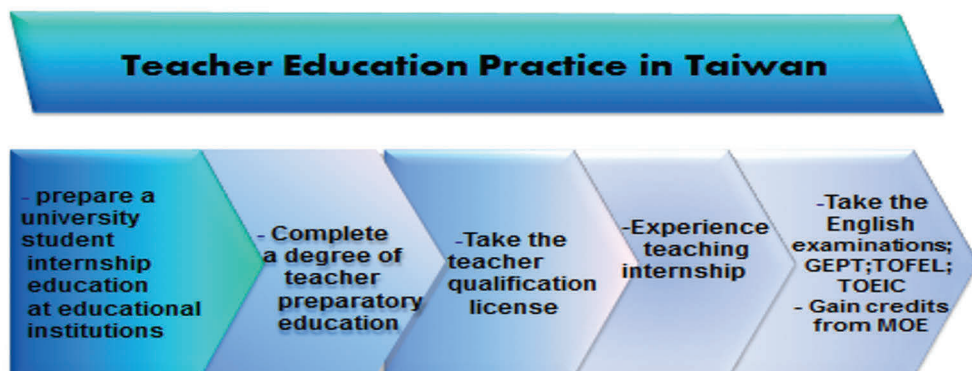
Figure 1. Teacher Education Practice in Taiwan

English is widely spoken in the Philippines with 93.5% of Filipinos able to speak and understand it well (Tizon, 2011). It is the language of business and instruction in schools and universities. Teacher