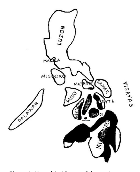
Figure 2. Map of the Visayan-Cebuano Language

(Visayan-Cebuano) language is spoken. As can be seen, this language is spoken in some parts of the island of Negros, the whole islands of Cebu and Bohol, the island of Siquijor, some parts of the islands of Leyte, Masbate, and Mindanao.